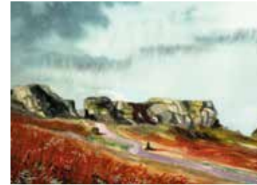
Cow and Calf, Ilkley