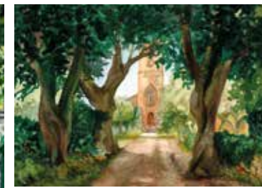
All Saints Church, Cawthorne