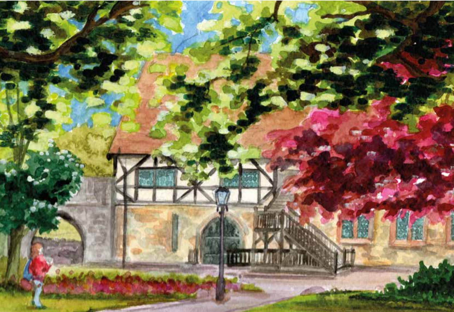
St Mary's Park, York