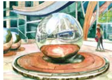
Millenium Square, Sheffield