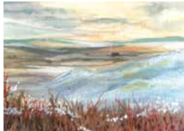
Marsden Moor Estate