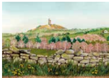
Castle Hill from Netherthong