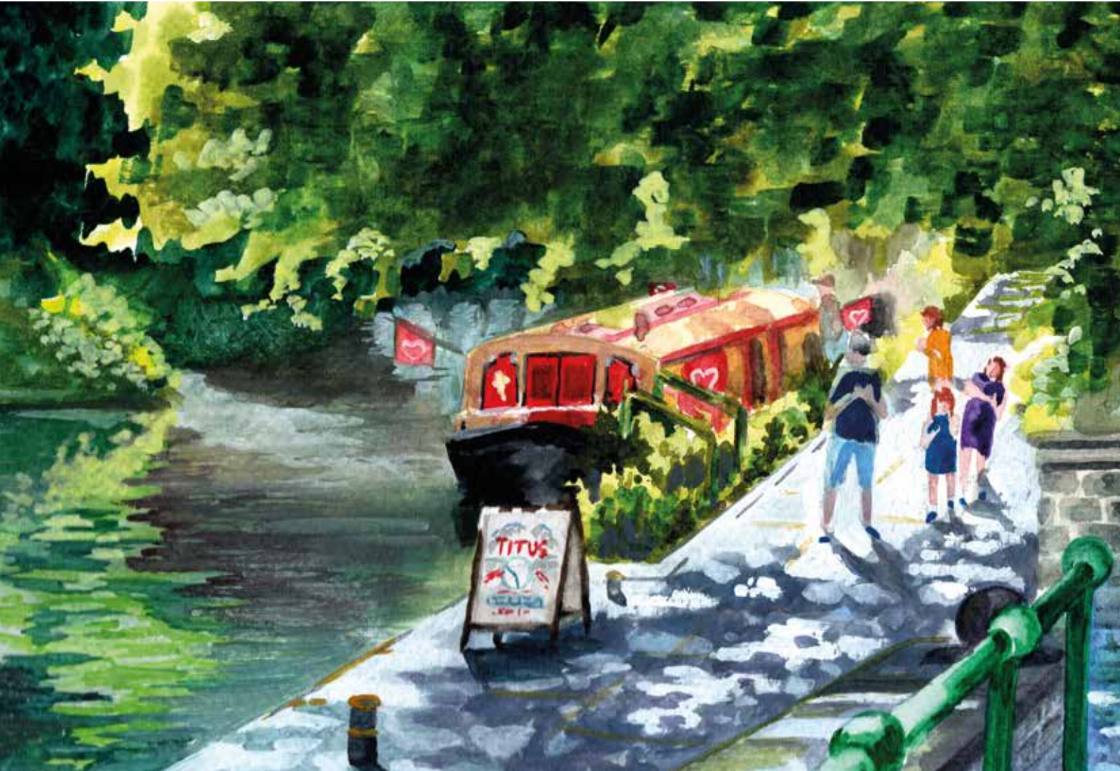
Shipleigh, Saltaire