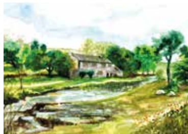
Langstrothdale, near Haughs