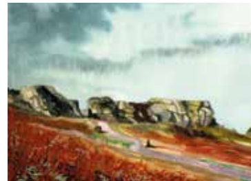
Cow and Calf, Ilkley