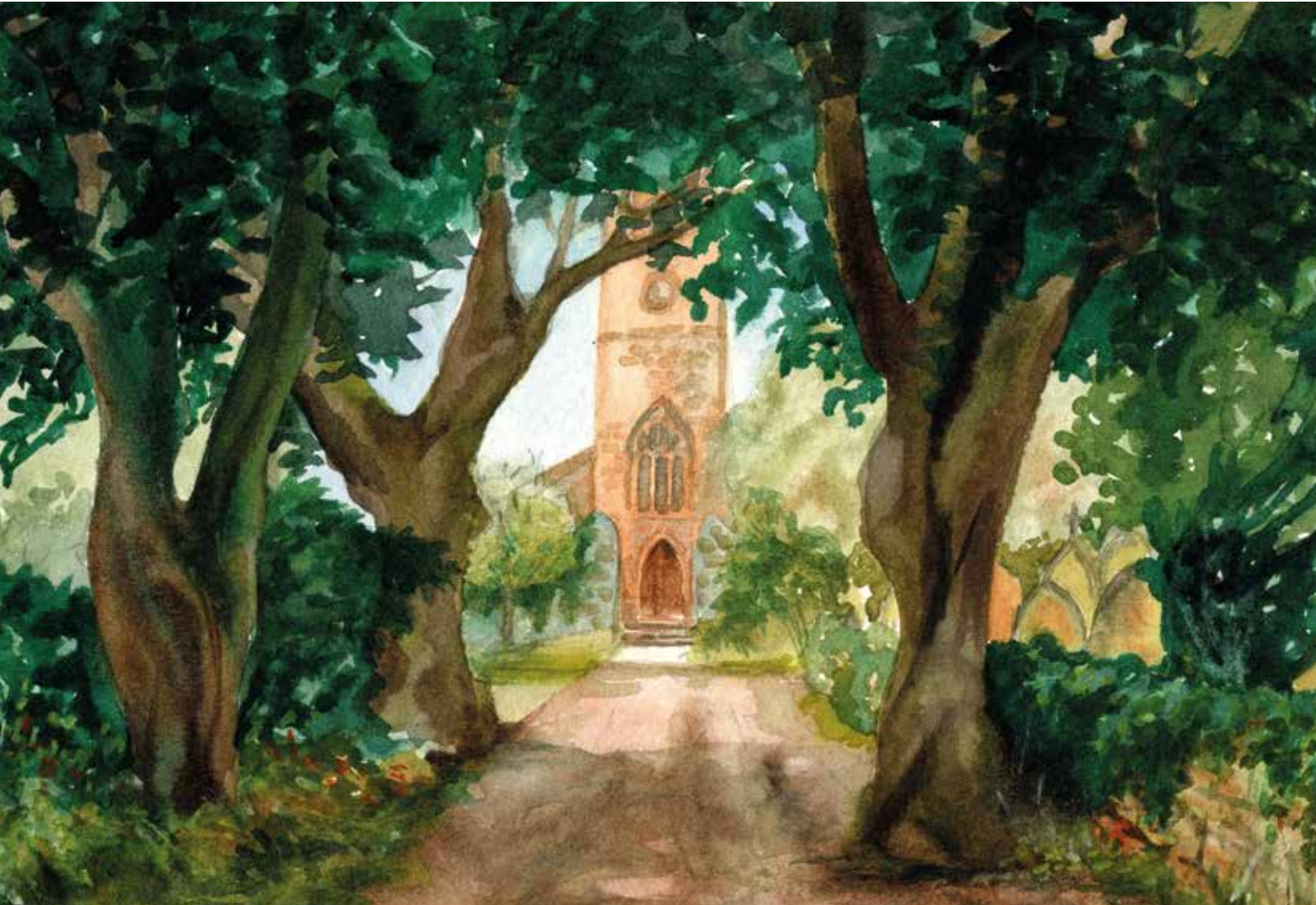
All Saints Church, Cawthorne © Stacey Shaw