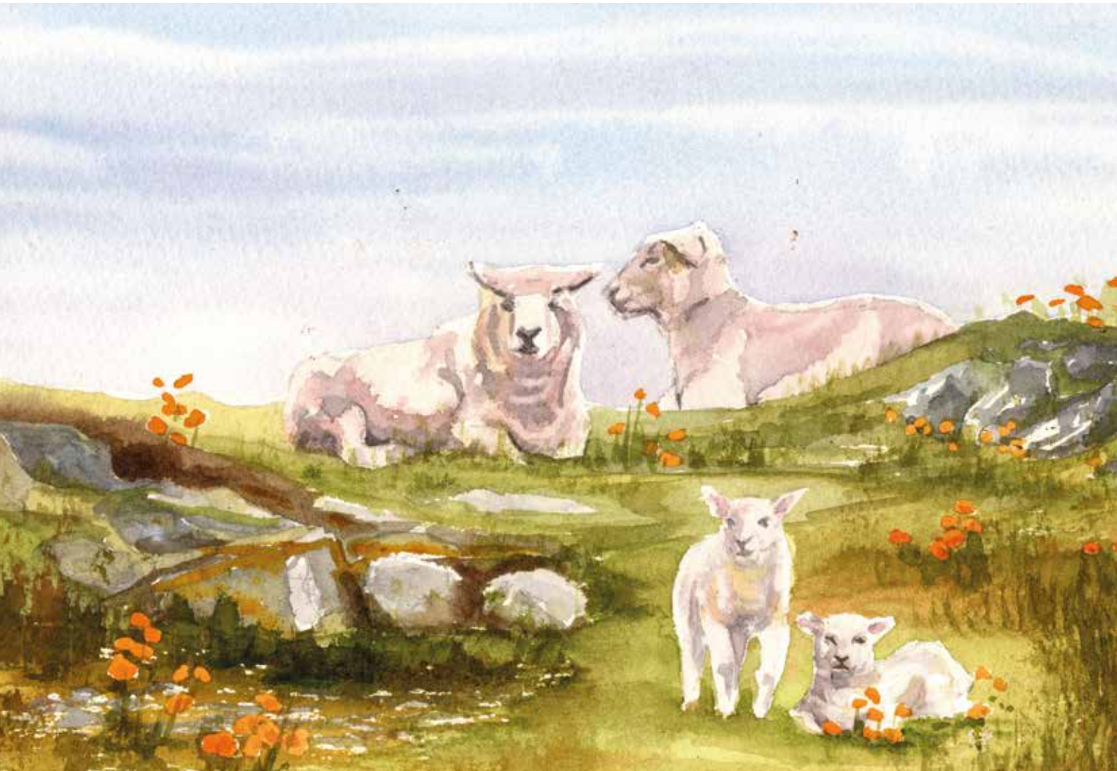
Yorkshire Dales