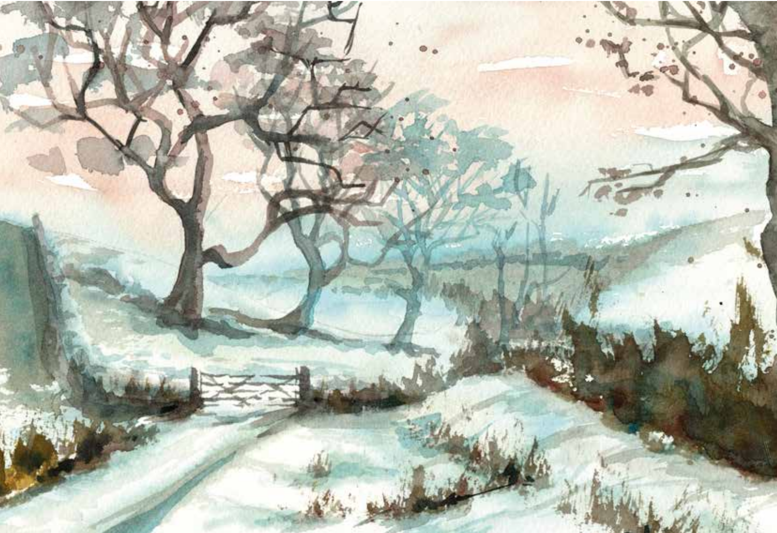
Otterburn © Stacey Shaw