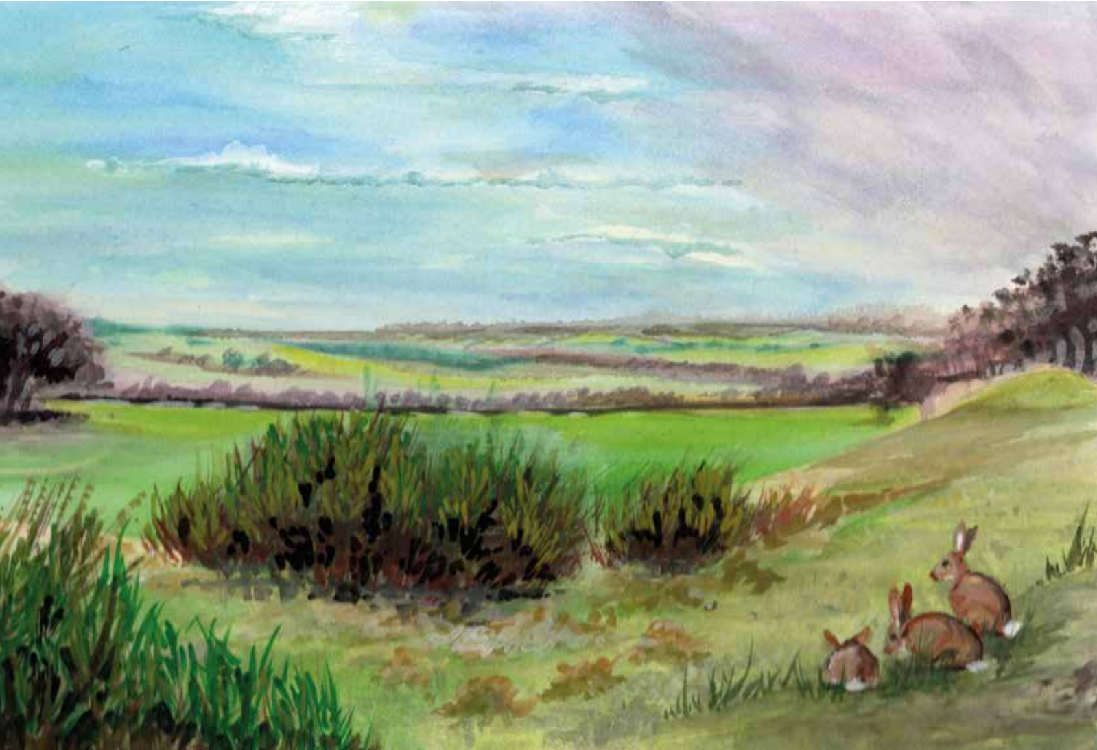
West Bretton © Stacey Shaw