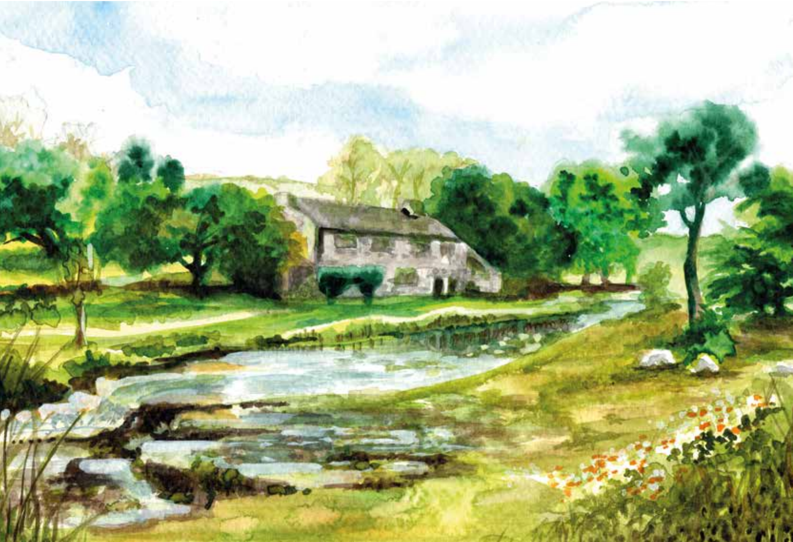
Langstrothdale, near Haughs