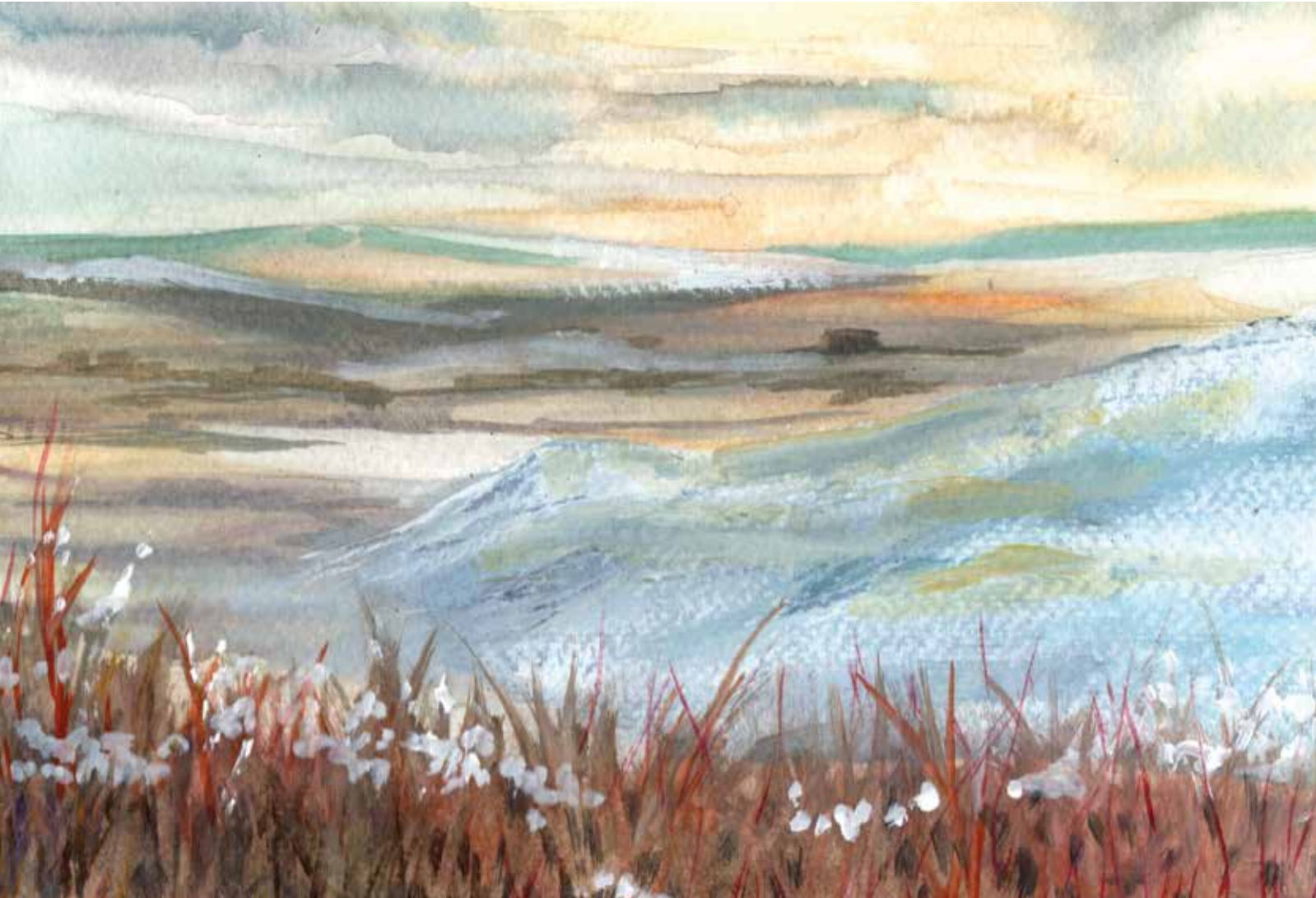
Marsden Moor Estate