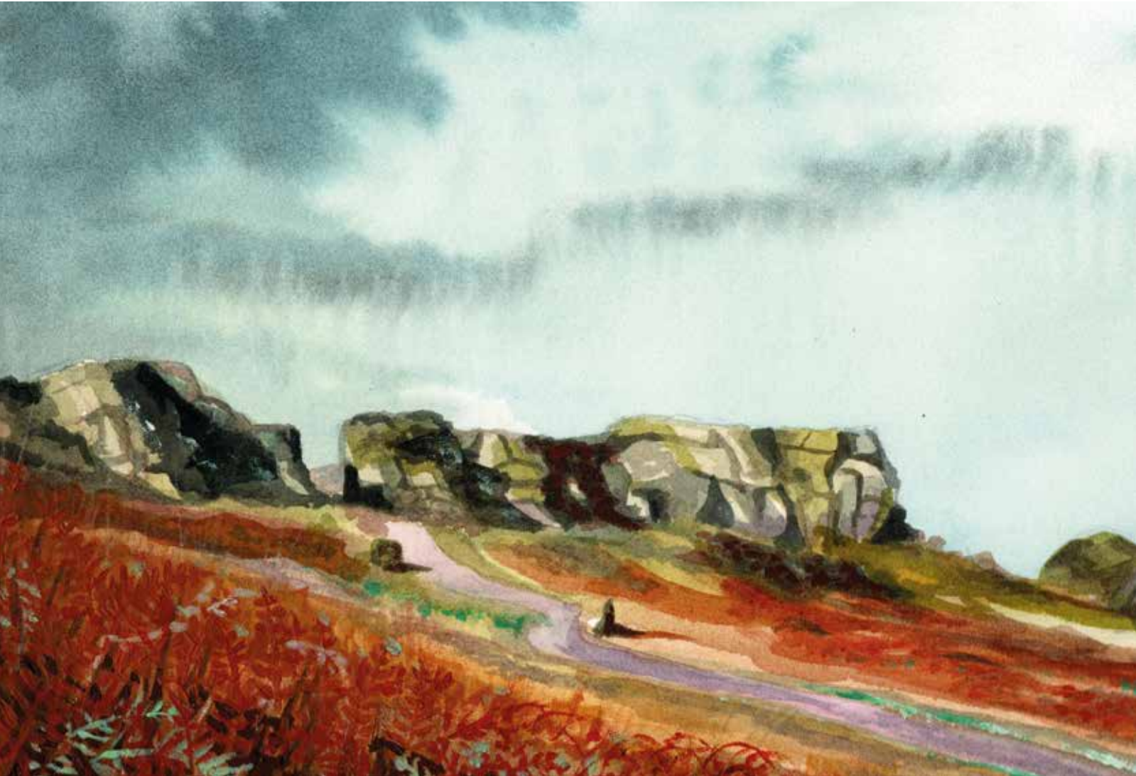
Cow and Calf, Ilkley © Stacey Shaw