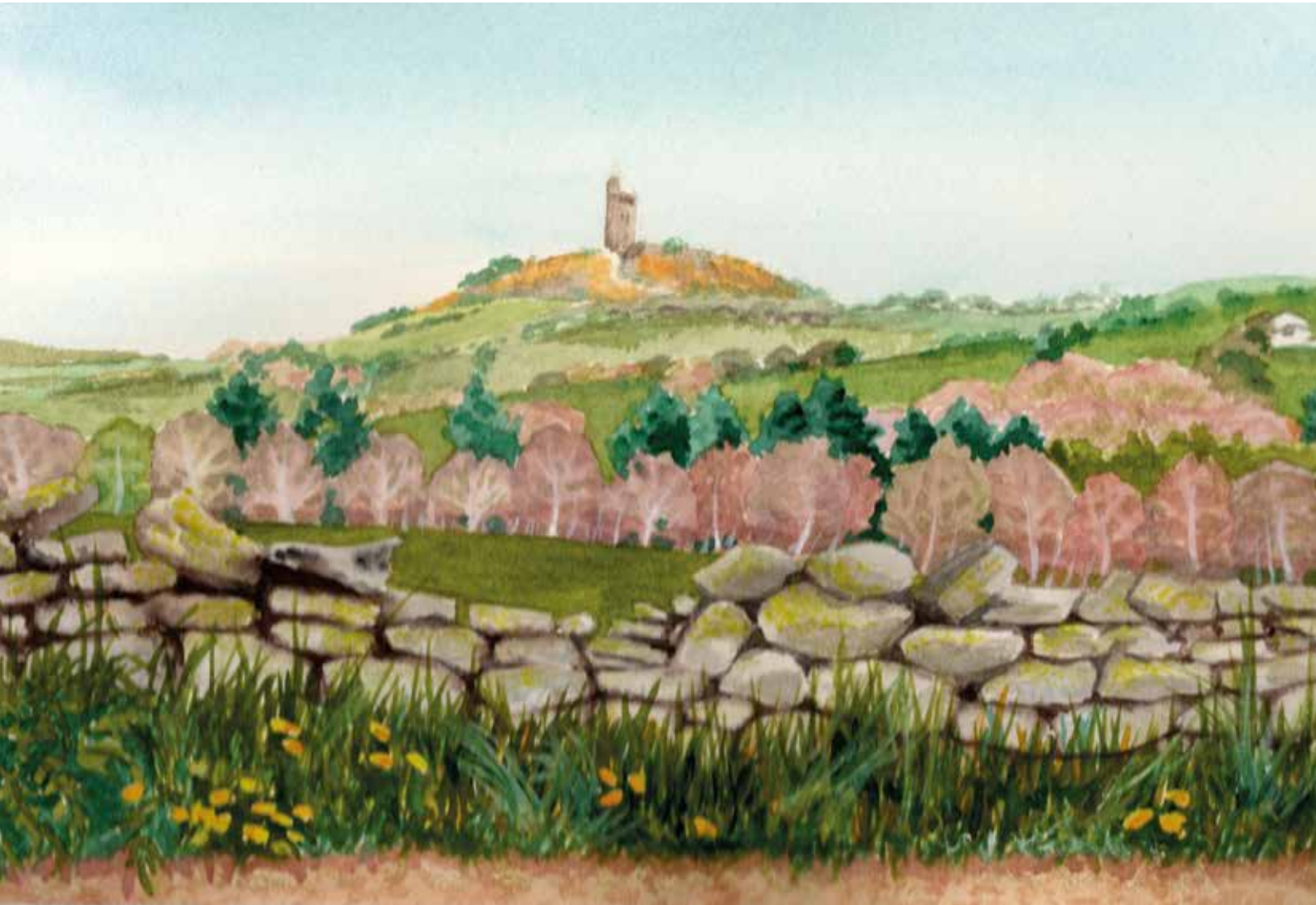
Castle Hill from Netherthong